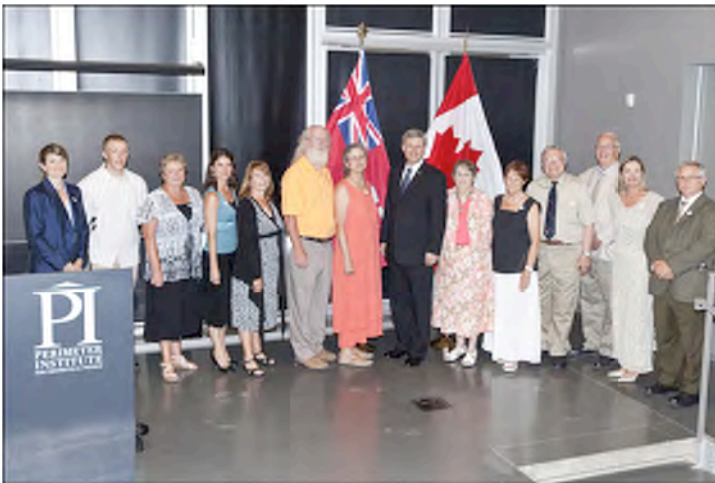
The Banting Family with Prime Minister Stephen Harper at the Perimeter Institute in Waterloo after the announcement of the Banting Fellowships.