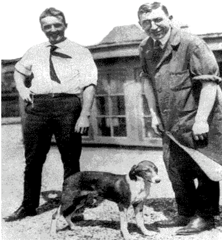
An archival picture of Sir Frederick (right) and his assistant, Dr. Charles Best, along with one of their many dog researchers.