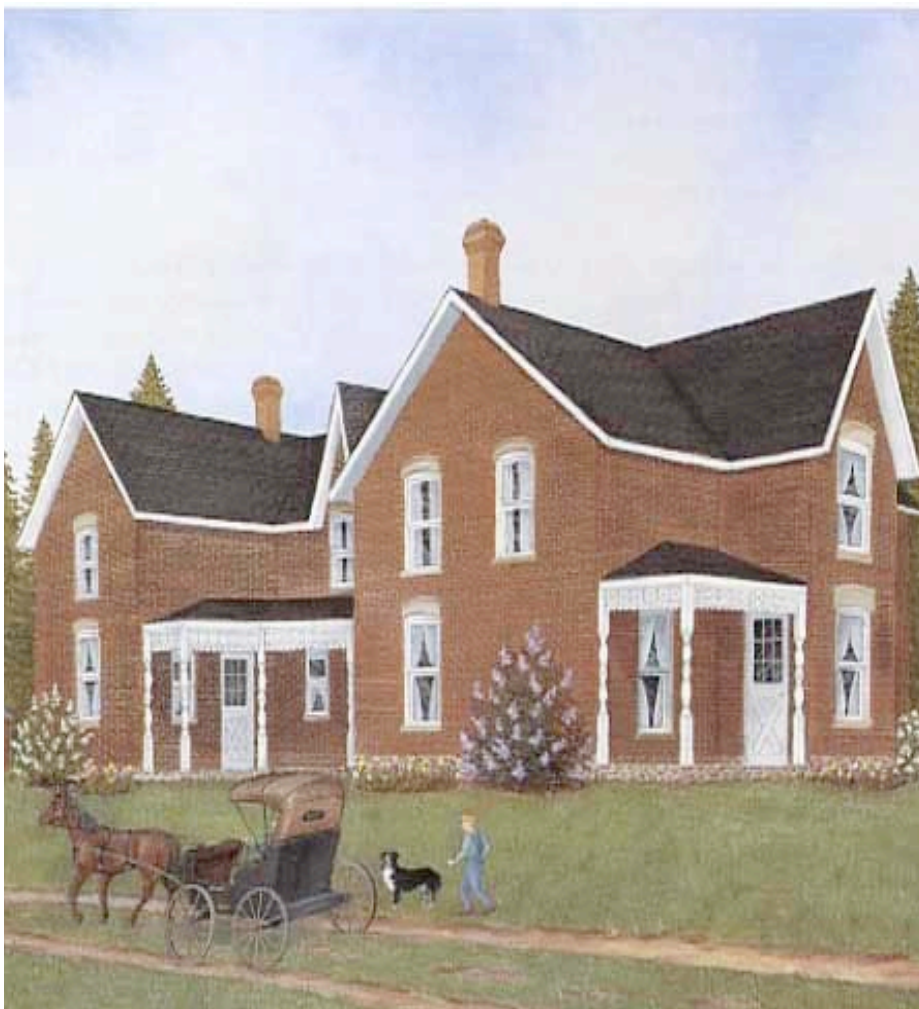
Painting of the Banting farm as it appeared in 1921 when insulin was discovered.

Did you know? Insulin has saved about 1 BILLION lives WORLDWIDE.